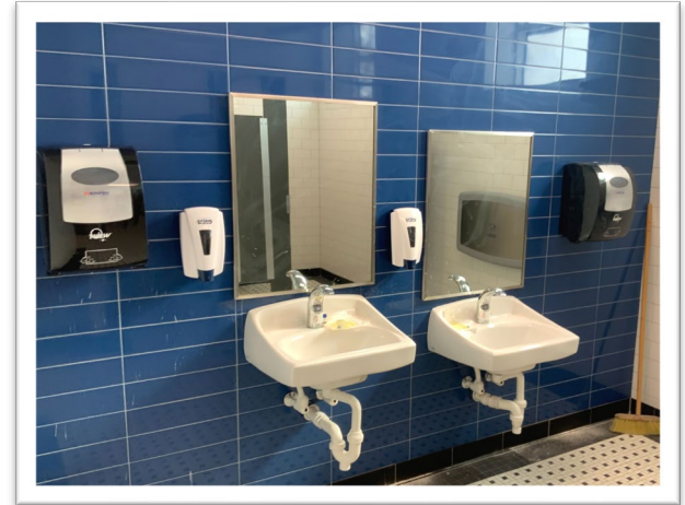
Restroom plumbing fixtures and accessories.