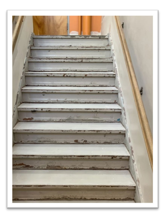
Stairway three - before, during and after demolition and leveling (remains unfinished).