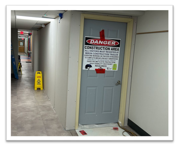
Temporary partition around the gym bathrooms.