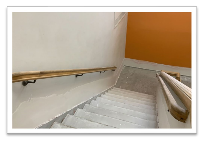
Walls are being patched and painted in stairway three.