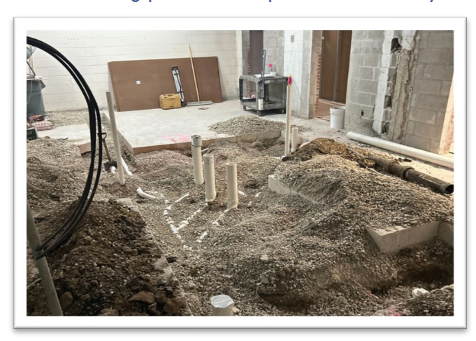
Underground plumbing rough-ins for the gym bathrooms.