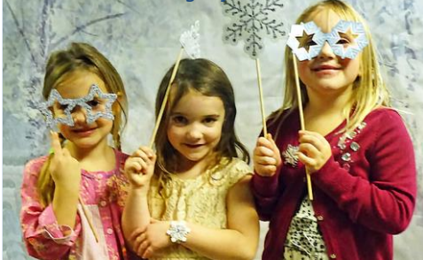
KinderKid Date Night fun!

Stay tuned for details on this year’s Family Skate Night. Due to warm weather, we’ve had to cancel the event the past two years but are hoping that some snow and cold comes this year in time for us to host this family fun night sometime in February. Keep your fingers crossed and ears open for further info!