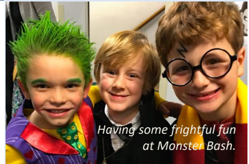
Having some frightful fun at Monster Bash.