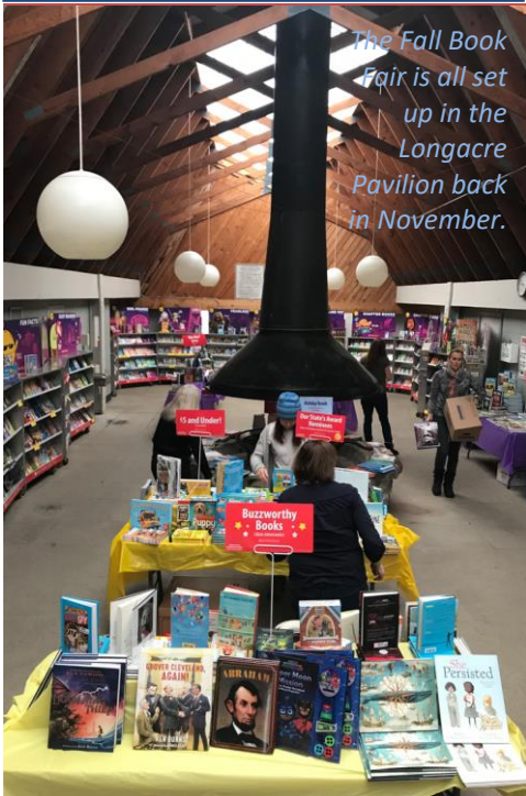
The Fall Book Fair is all set up in the Longacre Pavilion back in November.